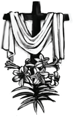
EASTER WORSHIP Experience